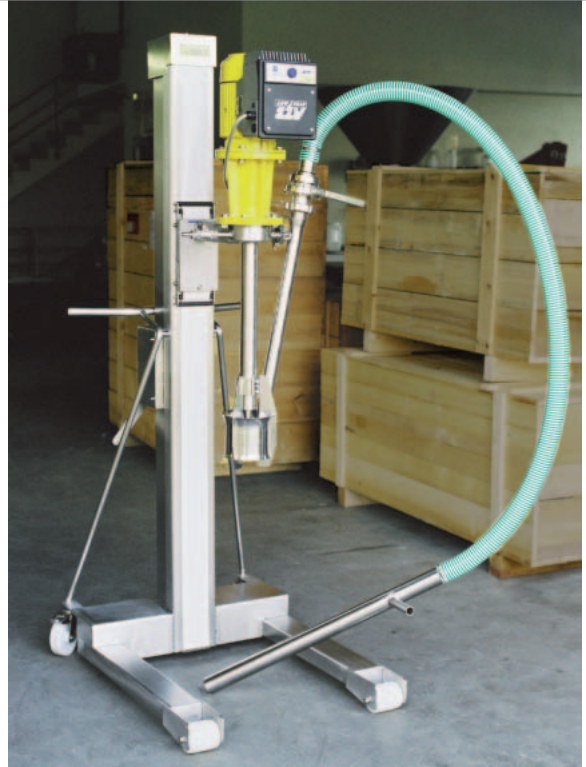
YTRON-Y with ByPass on a Mobile Hoist