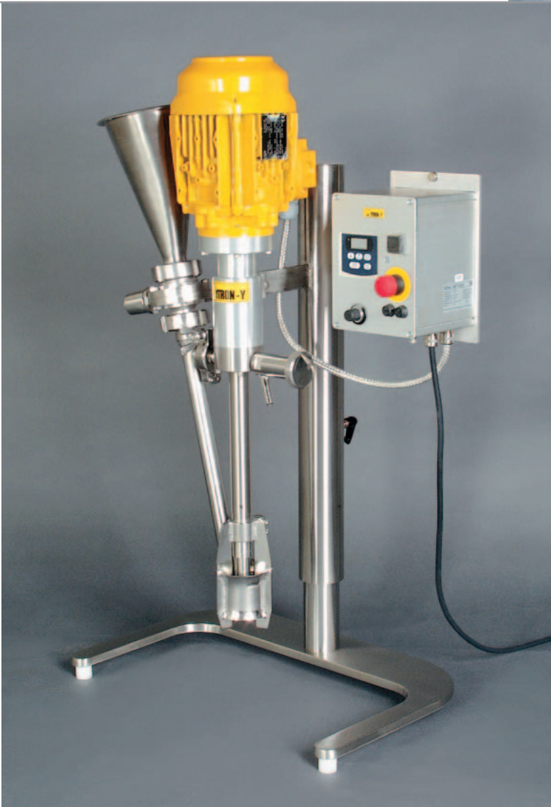
YTRON-Y with ByPass in Laboratory Design