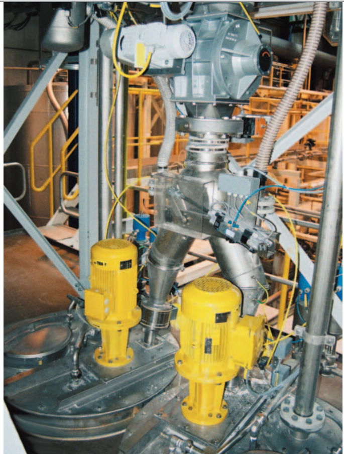
YTRON-Y ByPass in the Brewing Industry Application: Suspending of Diatomaceous Earth CO 2 inerting for a Continuous Discharge of the Product.