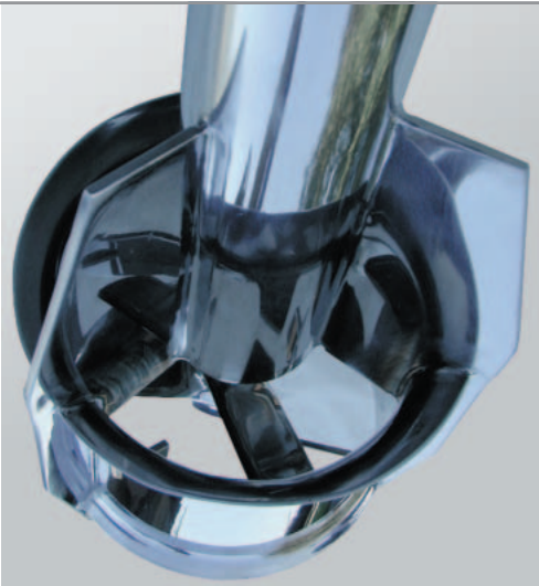
YTRON-Y in the Pharmaceutical Industry Application: Tablet Coating Solutions

According to the application, special construction deviating from standard are available.